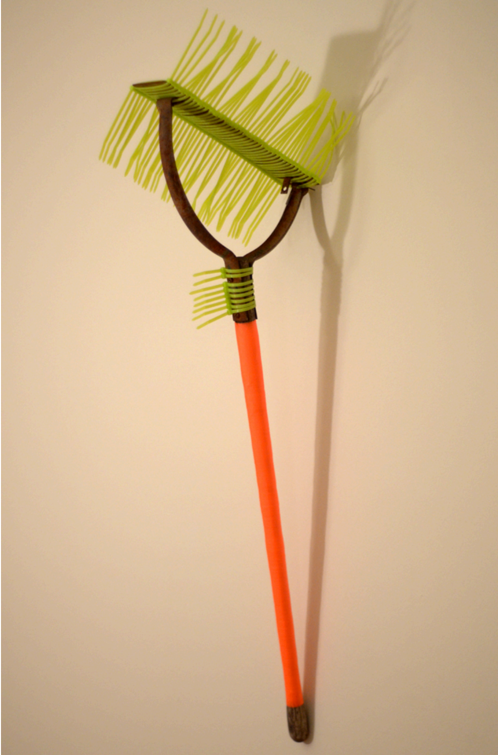
Brian Jobe, "deeply: deep weeds" 7" zip ties, flagging tape and a found object, 2010 43" x 8" x 14"